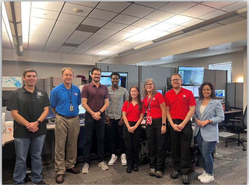
→ OEM with the Houston/Galveston NWS Office

Office of Emergency Management www.uh.edu/oem