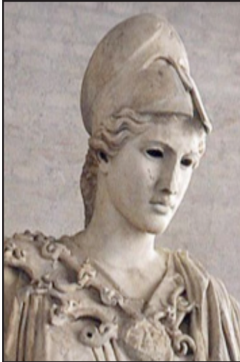
The clear-eyed goddess Athena, patron of the polis, of wisdom, and of war

Phronesis is the Greek word for prudence or practical wisdom. Aristotle identified it as the distinctive characteristic of political leaders and citizens in adjudicating the ethical and political issues that affect their individual good and the common good.