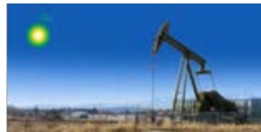
BP, US Lower 48 onshore