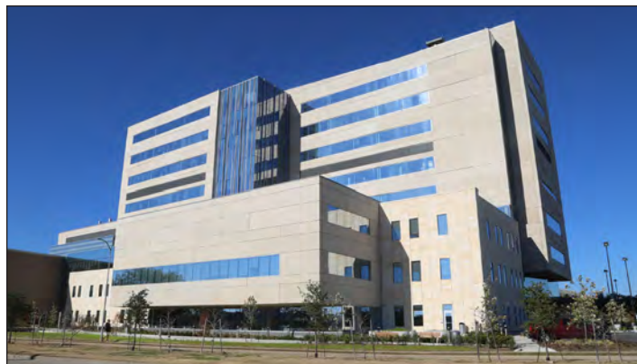
UH College of Pharmacy's new home spans nearly 140,000 square feet over five floors in the nine-story, 300,000-square-foot Health Building 2.

The department moved into the college's new Health Building 2 on the UH campus in December 2017. In addition to be equipped with state-of-